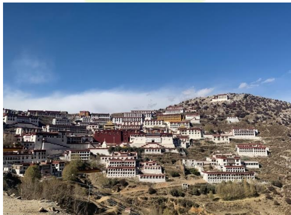
Mountain Range on the way to Everest Base Camp in Tibet.