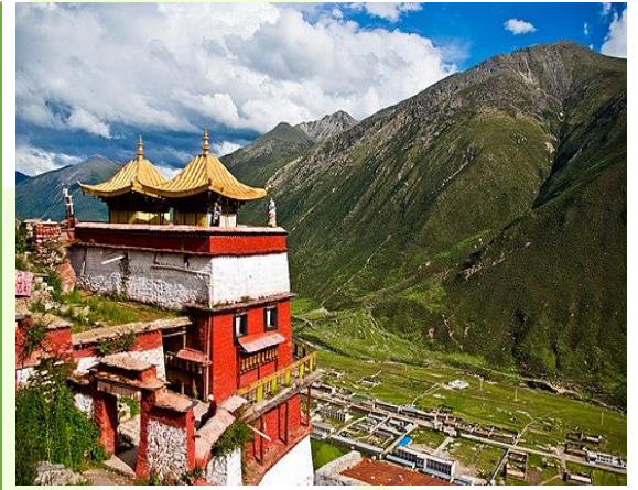
Image: Drigung Monastery.

Due to different landscapes and cultures, Kathmandu and Lhasa are uniquely separated by the high Himalayas. During this trip, we visited the world's most prominent temple for Hindus and Buddhists in Kathmandu. In contrast, we explored the ancient city and monasteries influenced by Tibetan Buddhism in Tibet. In Lhasa, we visit Potala Palace, an icon of Tibet and Tibetan Buddhism. On the 4th day in Tibet, we drive to Tidrum Nunnery, 110 Km from Lhasa, where you can enjoy the natural hot spring. After completing the nunnery tour, we visit the ancient Drigung Til Monastery, which also plays a vital role in the development of Buddhism in Tibet. In Drigung Til, tourists are not allowed to see the sky burial site, but you can visit the monastery here and enjoy the view of Zhorong Chu valley.